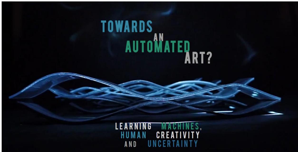
Image: Rodrigo Gomes, Deep White for Black, 2016, Courtesy of the artist. Web Design: Luis D. Rivera Moreno